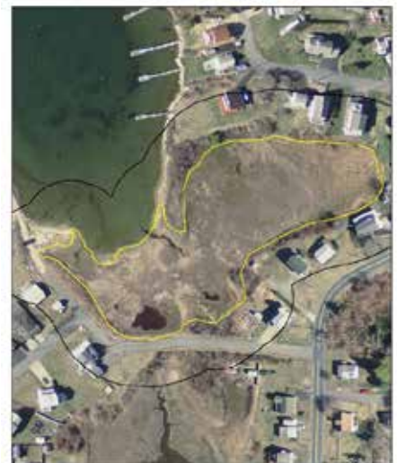
Hundred Acre Cove MU1, Barrington

Legend ■ existing_municipalities ■ existing_2010_boundaries