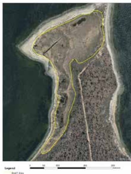
Providence Point, Prudence Island