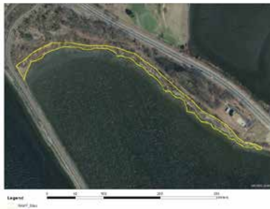
Watchemoket, East Providence