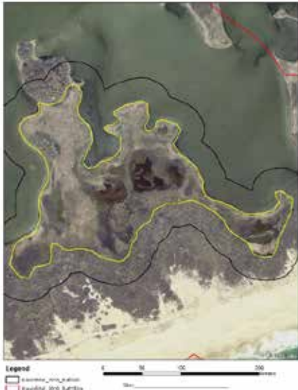
Ninigret Control, Charlestown