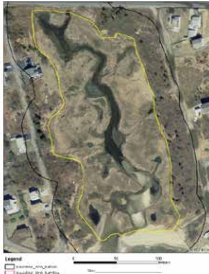
Old Mill Cove, Warwick