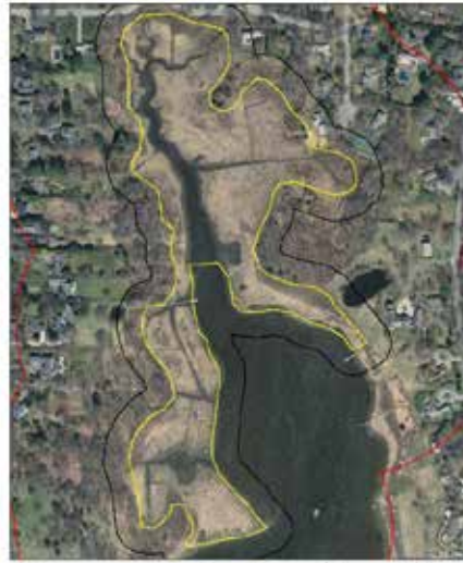
Smith Cove, Barrington