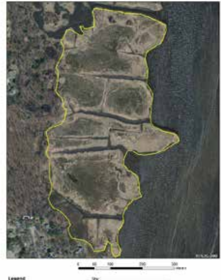
Palmer River, Barrington