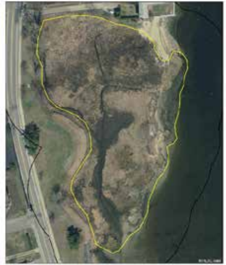
Stillhouse Cove, Cranston