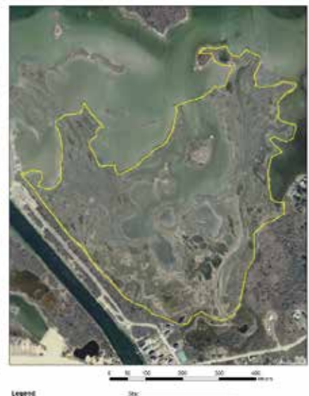
Quonnie East, South Kingstown