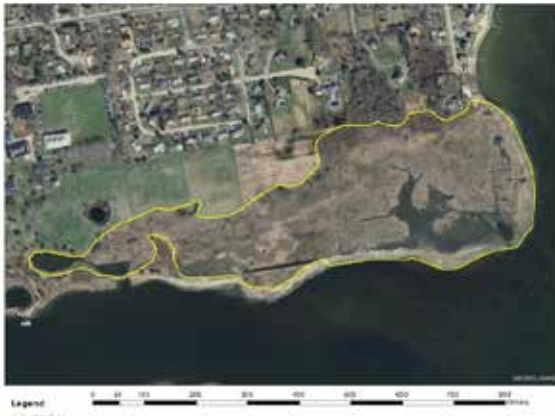
Rocky Hill, Warwick