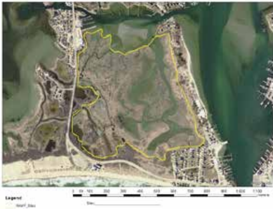
Succotash, South Kingstown