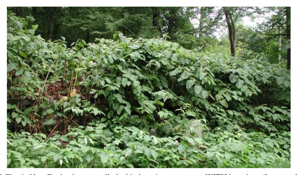
The SAME Classic New England stone wall, the kind tourists pay to see, WITH invasives (Japanese knotweed).