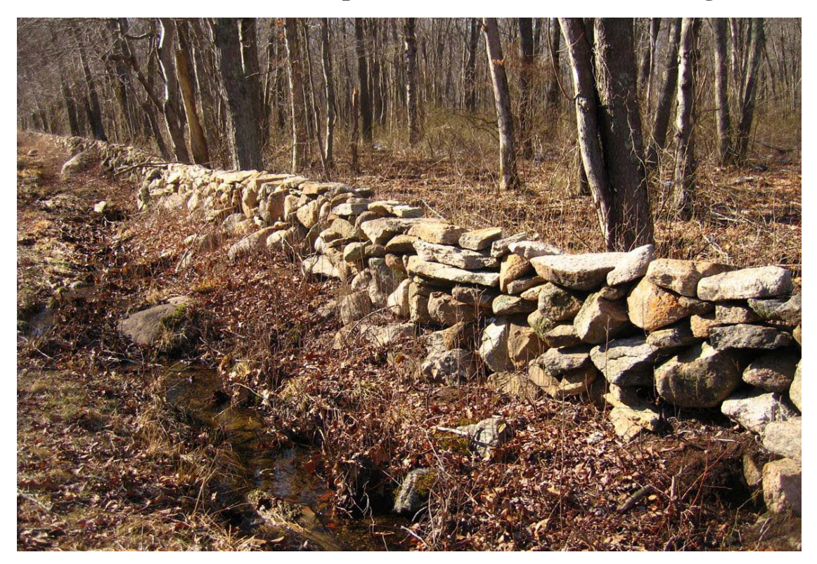
A classic New England stone wall, the kind tourists pay to see, WITHOUT invasives...